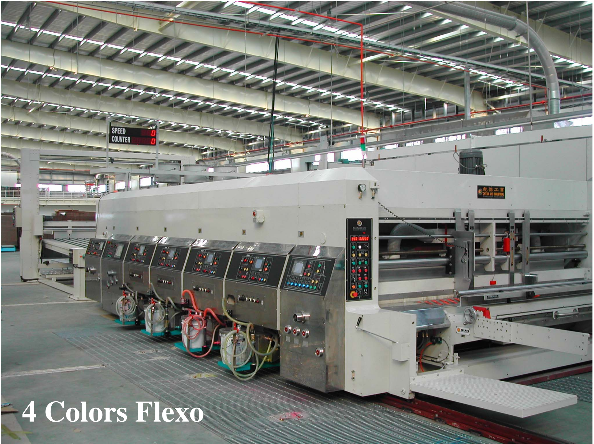
4 Colors Flexo